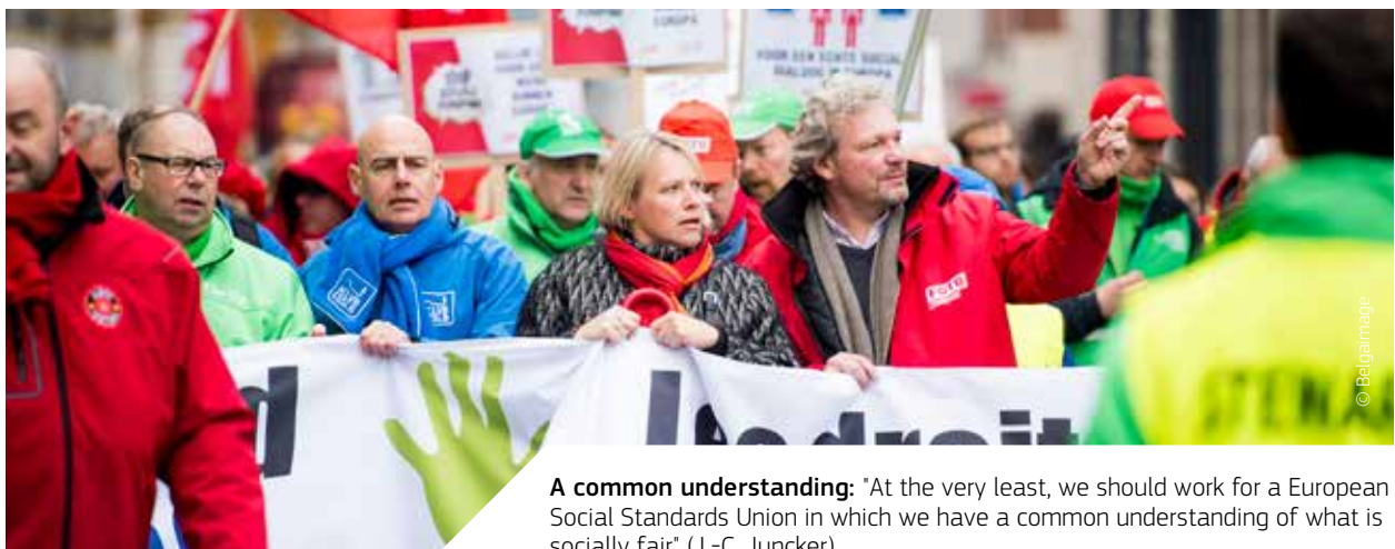
A common understanding: "At the very least, we should work for a European Social Standards Union in which we have a common understanding of what is socially fair" (J.-C. Juncker).